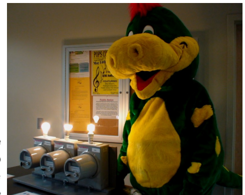
Greenie with the energy meter display!

On display in City Hall (shown in picture to the right) is a meter that displays the energy used by incandescent, LED and CFL light bulbs. Each meter started at zero and is turned on during business hours every day. Stop by City Hall during the Take Charge Challenge to see how the light bulbs compare and to pick up your three FREE CFL light bulbs from the Utility Billing counter!